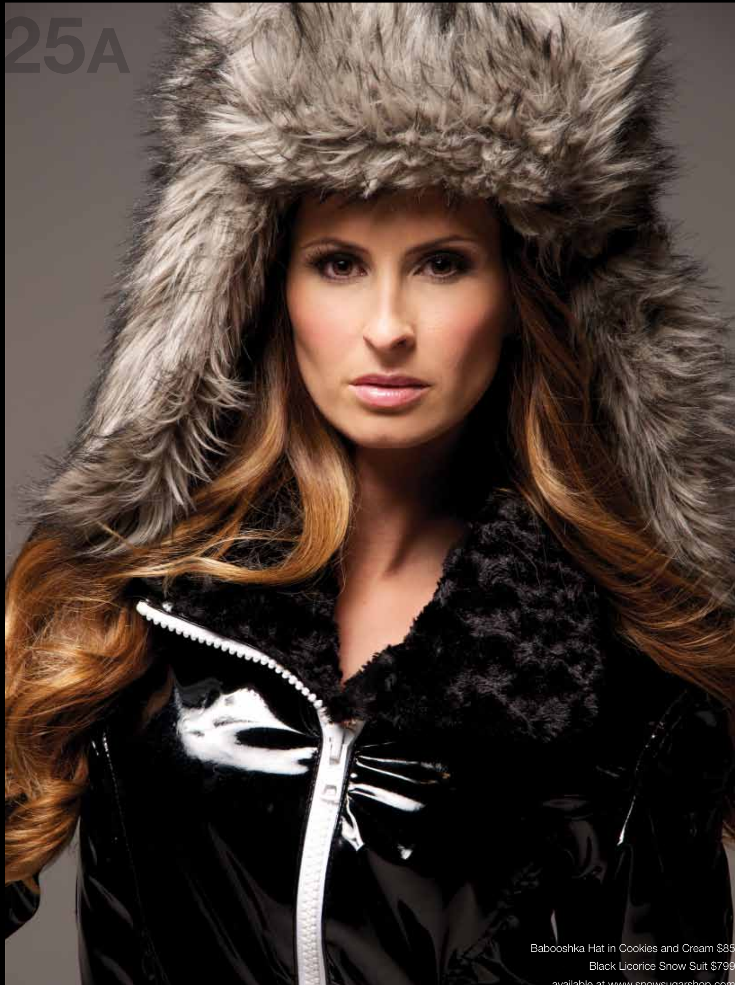
Babooshka Hat in Cookies and Cream $85 Black Licorice Snow Suit $799 available at www.snowsugarshop.com